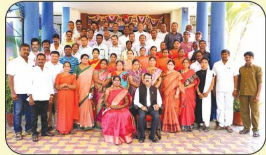
Non Teaching Staff